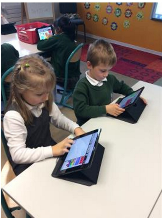
Grade 2 Computing - 'Spreadsheets'