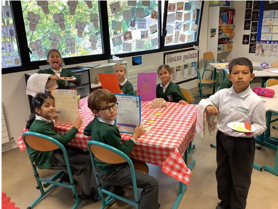
Grade 3 French (FLE) - Restaurant role-play

The school cannot accept responsibility for toys that are lost or damaged.