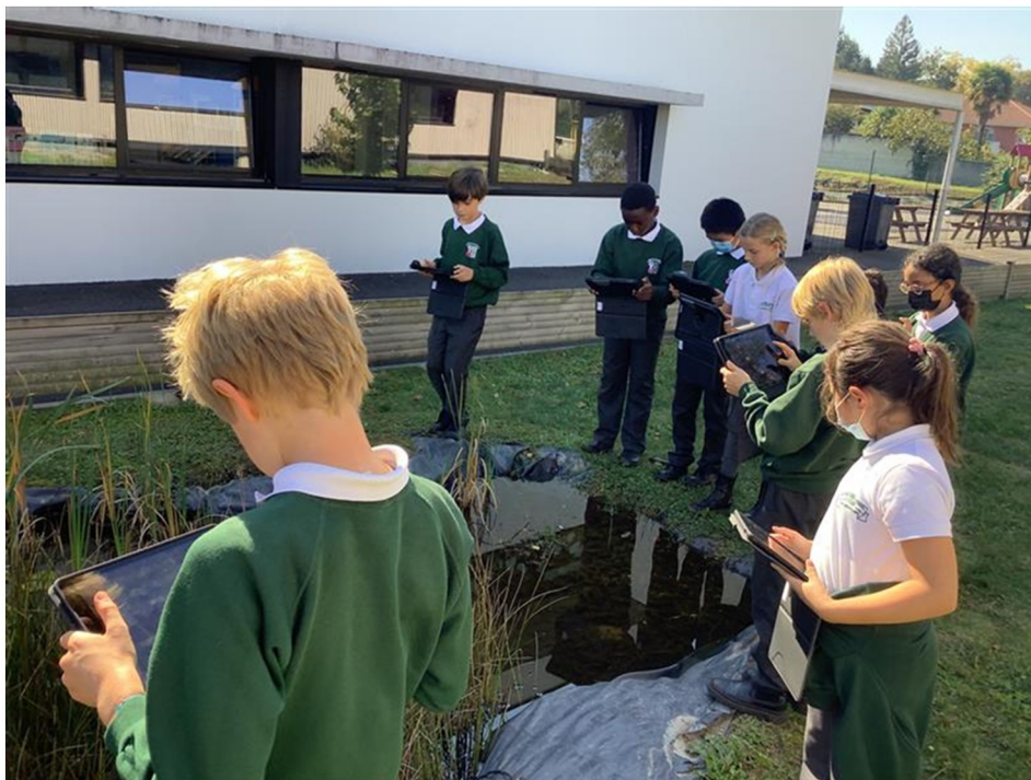
Grade 5 investigate life-cycles during Science