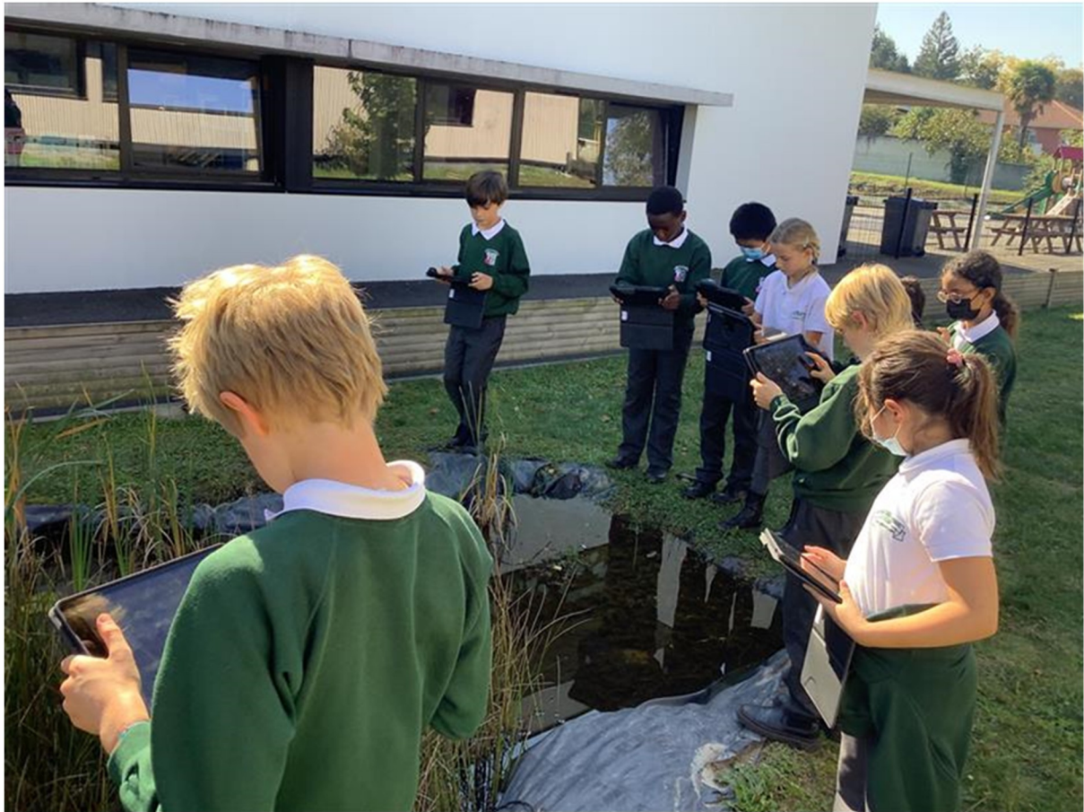
Grade 5 investigate life-cycles during Science