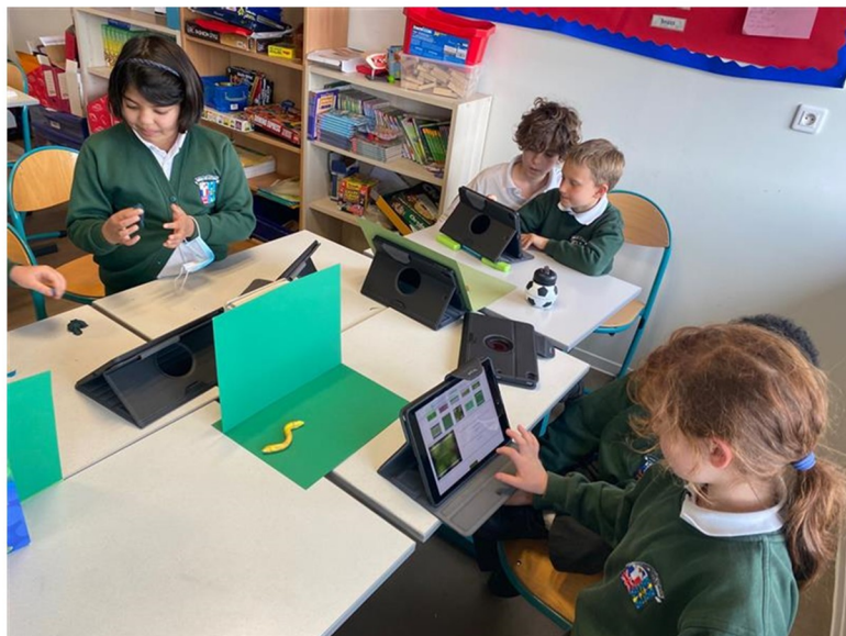
Grade 4 Computing - Stop-motion animation using 'green-screens'