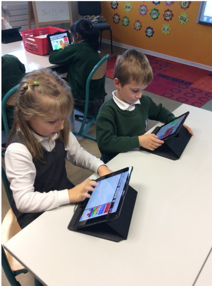
Grade 2 Computing - 'Spreadsheets'

Parents are encouraged to visit these sites on a regular basis as they will be able to keep in touch with the different learning taking place through photos, accounts and interactive activities for them to do with their children.