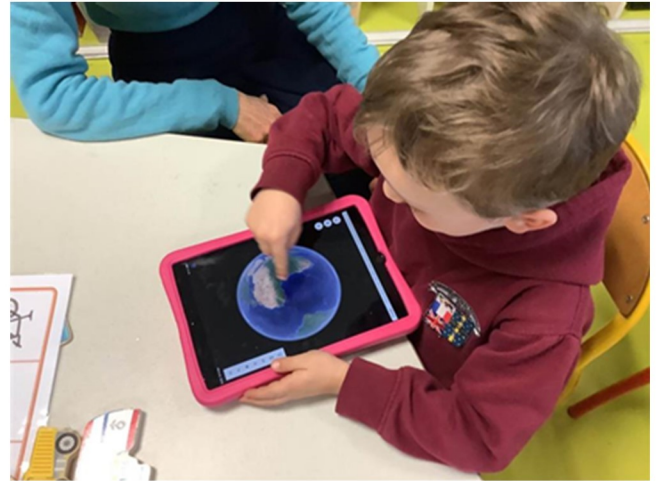
Reception Class discover and explore maps, using Google Earth , as a part of their 'Journeys' topic